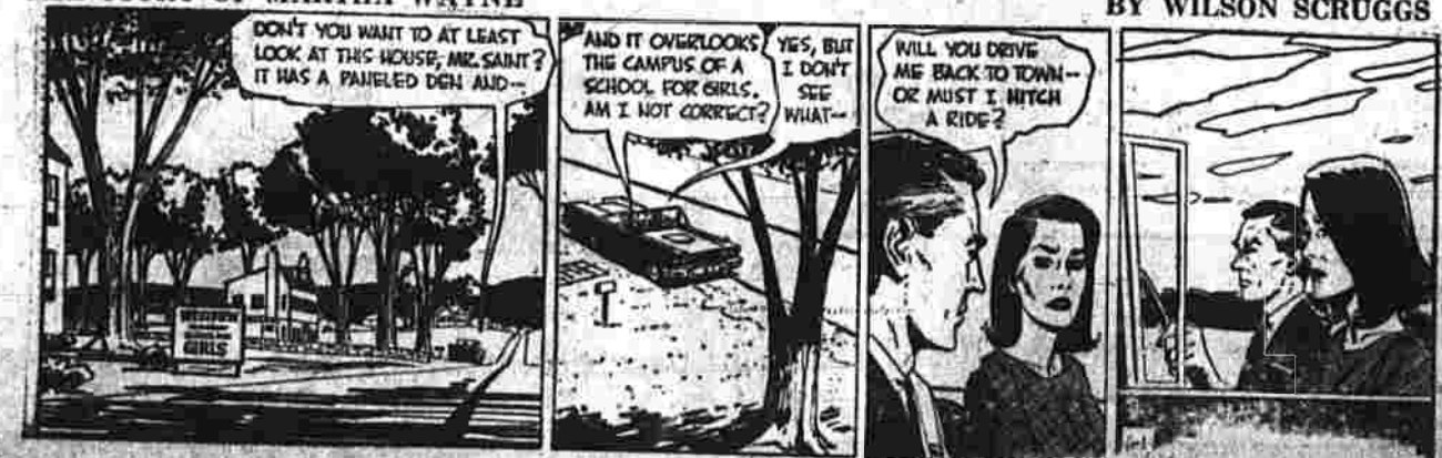
THE STORY OF MARTHA WAYNE