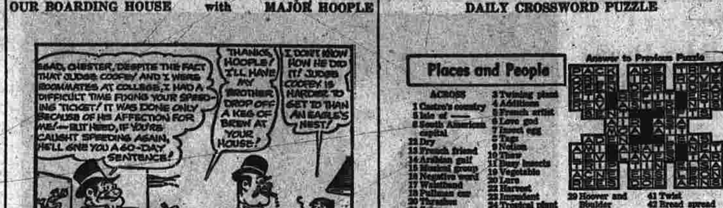
OUR BOARDING HOUSE with MAJOR HOOPLE